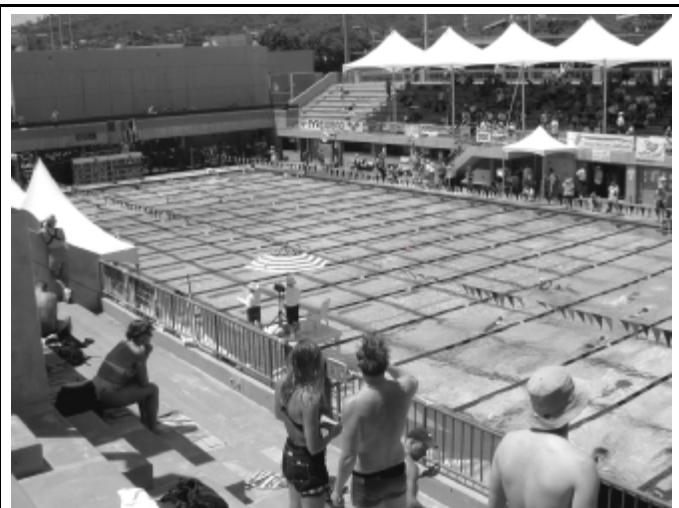
The Venue It was just as much fun as it looks and more.